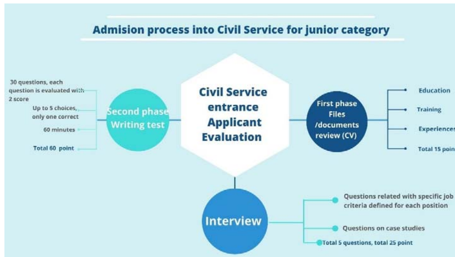
Figure 1. Recruiting phases in Civil Service for entry category

online recruitment procedure, enabling the continuation of recruitment in state institutions part of the civil service in compliance with social distancing measures, thus marking a further step in the digitalization of the recruitment process.